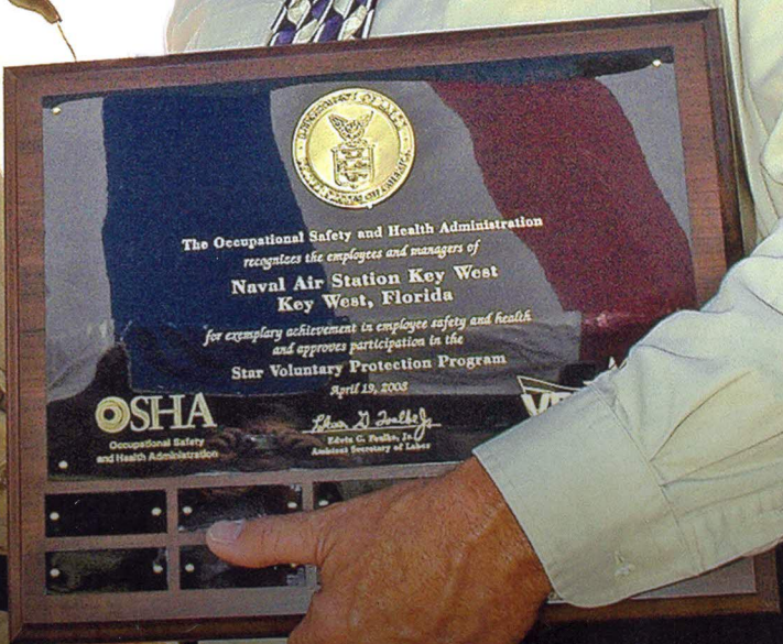
NAVAL AIR STATION KEY WEST IN KEY WEST, FLA., IS BEING RECOGNIZED AS A VPP STAR SITE.